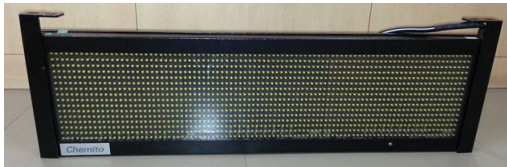
Rear / Side Display