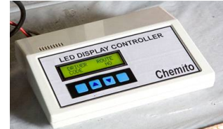
Display Controller EMBDC