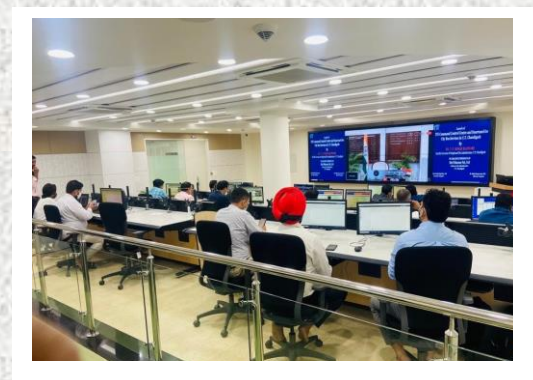
Launch of Chemito ITS at CCC,CTU

Chemito has facilitated a huge cost saving for CTU by driving different display boards (Hanover, Cast Master make) using Chemito make universal controller.