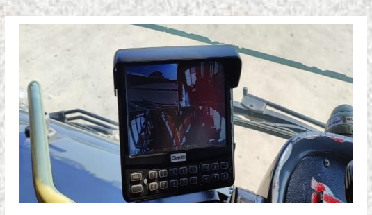
Chemito Intelligent Transport System-Bus Driver Console

activities Bus can be visualized & route operations could be traced by CCC (Control Command Centre) under one roof with advanced features in Chemito ITS like Remote Live Streaming, GPS, Bus Scheduling, Next Stop Announcement.